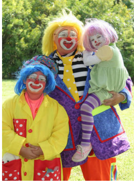
The Baphoon Clown Family- Two Auguste Clowns and a Little Whiteface