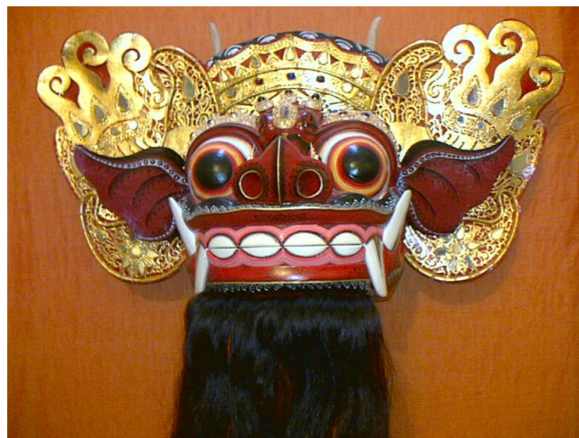
Balinese Barong Mask