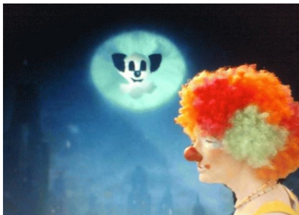
Calling All Clowns - photomontage by Chip Christy, used with permission

There are many specific steps ahead, including completing training in a clown and dog visitation program through a local animal shelter, to begin my work as a caring clown, and beginning my Red Cross disaster response training. The most significant change will come through the removal of impediments to being available to be a first responder, including early retirement from full time teaching and beginning a life as a professional performer and part-time teacher. What is important is to remember that "the purpose of the journey, is the journey itself" (Lecoq, 2001). Red noses are probably required.