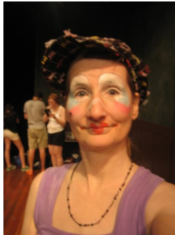
Working on a Fabulous Face at the Ultimate Clown School, July 2006