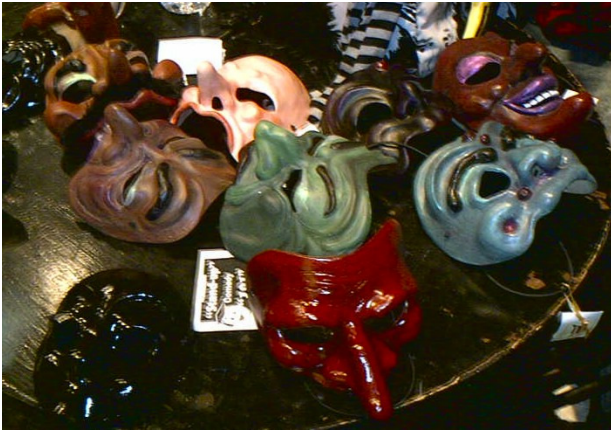
Commedia dell' Arte Masks created by Jeff Semmerling, Inside Out Art Studio photo by K.J. Weaverling

The workshop with Ginevra Sanguigno from Clown One Italia similarly began with exploring the dynamic aspects of creative movement in space, tempo, and emotion. The specific mask work used the two comic masks of Arlecchino and Pulcinella from the Commedia dell' Arte. The performers worked in pairs doing improvised scenes with these two characters.