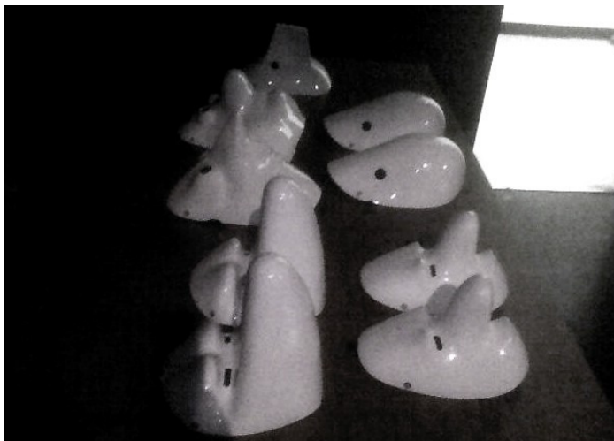
Basel Masks

The workshops in the theater tradition used both basic masks and character masks. Larry Hunt emphasized basic movement working with larval masks of his own design. These larval masks were not specific replicas of human features, but were masks with features simplified to embody the essence of specific human emotional states. Ross Brown worked with basic Basel masks of Fatty, Charlie, Idiot, and Lizard. These “larval” masks, commonly used in Lecoq work, are ones that evolved from the Basler Fasnacht carnival in Basel, Switzerland. “Larve” is German for “larva” and is the term used by this carnival tradition to refer to their masks. Extensive creative movement work with and without the mask preceded the scripting, rehearsal, and performance of 3-part scenes with the Basel characters.