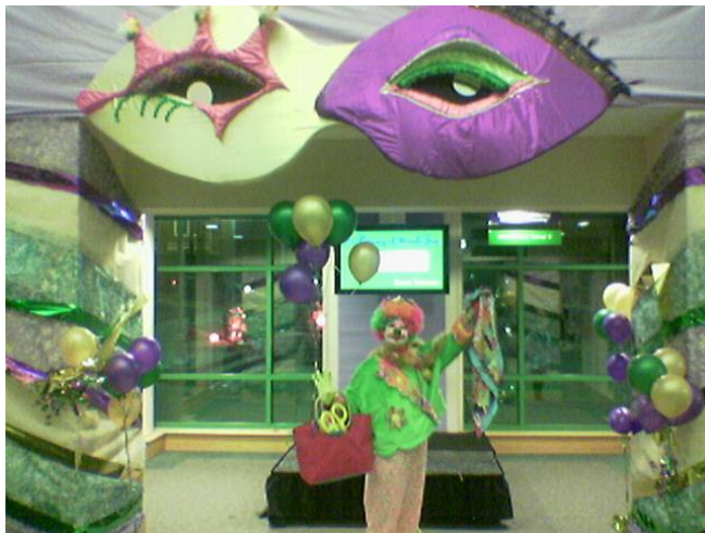
Clowning Around At Mardi Gras, February 2006

other bits of schtick, primarily encouraging folks to boogie to the numerous musical ensembles. At one point in time, I got a message from the singer in the headline band. The clown was wanted in the main event room. The room atmosphere was too funereal for her liking, and she commanded me to "get these folks up and dancing." It is always nice when one's marching orders are clear and precise. A discovery was made then that doing the Electric Slide in standard issue eighteen inch clown shoes is – different. Overall, I was still pretty unclear about what a clown was "supposed" to do, but this time, I was enjoying the confusion tremendously. I was paid a great compliment that night by the President of Wilmington City Council, who stated that I was the best clown he had ever seen.