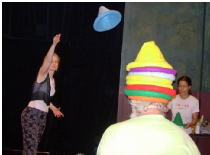
And One More Will Make It Ten – at the Ultimate Clown School, July 2006

I signed up to present for the Wednesday night performance workshop in the second week. There were many differences between this presentation and the one the previous week. This time I had a script, which was my take on the ubiquitous light bulb jokes – “How many clowns does it take to change a light bulb?” The joke is that this clown doesn’t have any idea how many clowns it takes to change a light bulb, and the narrative of piece is based the internal emotional consternation of the clown in finding herself in this predicament. I had a clear idea of what I wanted to accomplish, and how to do it. All that remained was that I deliver it well. If this were another flight at Kitty Hawk, this time I soared. The laughter started at the first beat of the joke and never stopped, and I had my first great success at clown school. This was a small event, but it was an important one for me. I was not going to leave clown school without ever performing a successful piece. I had discovered some personal strengths in clowning, including putting my years as an outfielder to good purpose in being an expert hat tosser. I had also discovered that I could learn this art. The process was not going to be complete by any measure in two weeks, but I had settled some of my personal doubts.