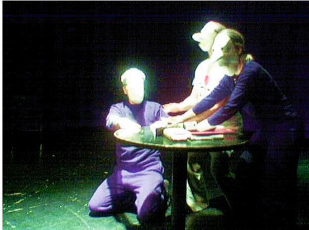
"Charlie" Gives Lessons to Two "Idiots" Basel Mask Workshop