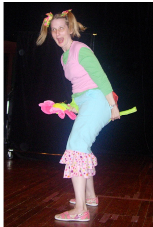
First Presentation Workshop at the Ultimate Clown School, July 2006

It was the excited discovery of another physically based art form, and my aptitude for movement was a decided advantage. It was the morning of the third day, sitting in the risers of the Flea Theater where classes were held, that I became aware of how badly I wanted to learn to clown, and to perform it well. That evening was the first performance workshop and I had signed up to “present,” even though I had no clue of what I was to do, and little time to prepare. I had put together bits from the first classes, a little balancing, a little movement, no clear logic, to be performed to some traditional circus music. Larry Pisoni’s axiom: “Energy trumps content” was my mantra. Standing behind the curtain for my entrance, I felt like a parachute jumper on the first jump. The cue came, and I went out for broke.