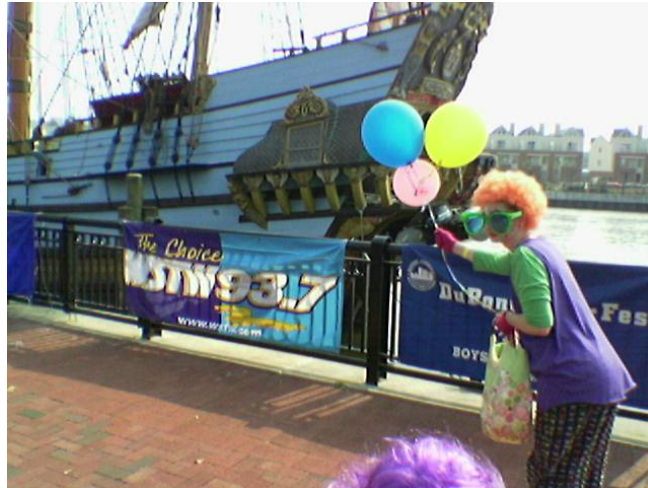
What Does A Clown Do Anyway? – Working at Riverfest 2005, Wilmington, Delaware, September 2005

My first activity was to go to a city-sponsored summer festival. As in all of the clown work to come there were a few spots of success, and a much lengthier list of issues that required attention and improvement. I nearly got arrested when crossing the street, for “clowning around in traffic,” while I merely was maintaining character on the median strip waiting for the light. It was blazing hot and the makeup would be described kindly as problematic and was saved only by hiding most of the face behind the out-sized glasses. Hesitancy was a big issue, as I didn’t have a script for working without one. I was just “out there” muddling through the experience and seeing what it was about. Despite the inner and outer confusion, one four year old child knew exactly what I was about, even more so than I did. She spied me from a distance, and instantly came running full tilt toward me with her arms wide open, and locked my legs in a bear hug. She said only one word, “clown”, and hugged me with a sincere passion that took me aback. I was amazed. I hadn’t “done” anything at all.